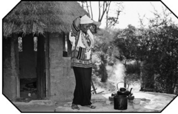
T ererai Trent in front of the hut in which she was born, in Zimbabwe (Tererai Trent)

Girls in poor countries are particularly undernourished, physically and intellectually. If we educate and feed those girls and give them employment opportunities, then the world as a whole will gain a new infusion of human intelligence—and poor countries will garner citizens and leaders who are better equipped to address those countries' challenges. The strongest argument we can make to leaders of poor countries is not a moral one but a pragmatic one: If they wish to enliven their economies, they had better not leave those seams of human gold buried and unexploited.